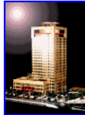
Model of New Kwangju Bank Building (Click for full image)

The process of developing a SISP is similar to building a 100-story building. There is a better chance of the finished building being exactly what the owner intended if he works with an architect. The architect develops a conceptual design diagram and a model, then develops the floor plans. This is illustrated by the model at right of the new Kwangju Bank building, with its distinctive rooftop helipad.