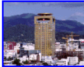
The Final Kwangju Bank Building, with its distinctive rooftop helipad (Click for full image)

Kwangju Bank's management had committed to full participation in developing an SISP. The bank began in a facilitated session with senior managers and other bank experts over two days. From these important meetings, a strategic model was developed using the Visible Advantage Enterprise Engineering tool, to analyze data models and identify cross-functional processes that indicate business-reengineering opportunities.